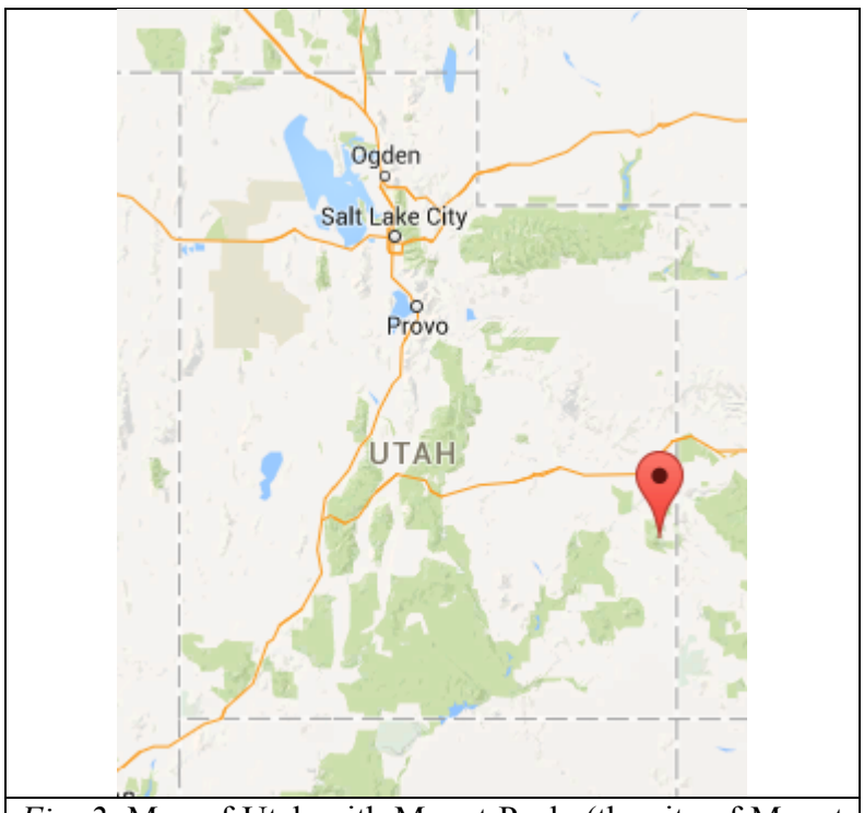
Fig. 2: Map of Utah with Mount Peale (the site of Mount Peale RNA) marked. 362

There is, therefore, good reason to believe that the Harrington's mountain goat once lived in the La Sal area<sup>363</sup> and that the native plant life evolved in the presence of an ungulate very similar to modern mountain goat suggesting that the introduction of mountain goat will have a negligible impact on native species in the La Sal range.<sup>364</sup> In fact, given that Harrington's mountain goat were likely extirpated in part due to human influence, the introduction of mountain goats is more